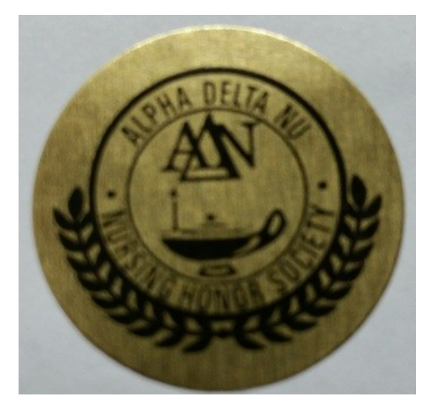
GOLD FOIL STICKER Actual size 1" in diameter